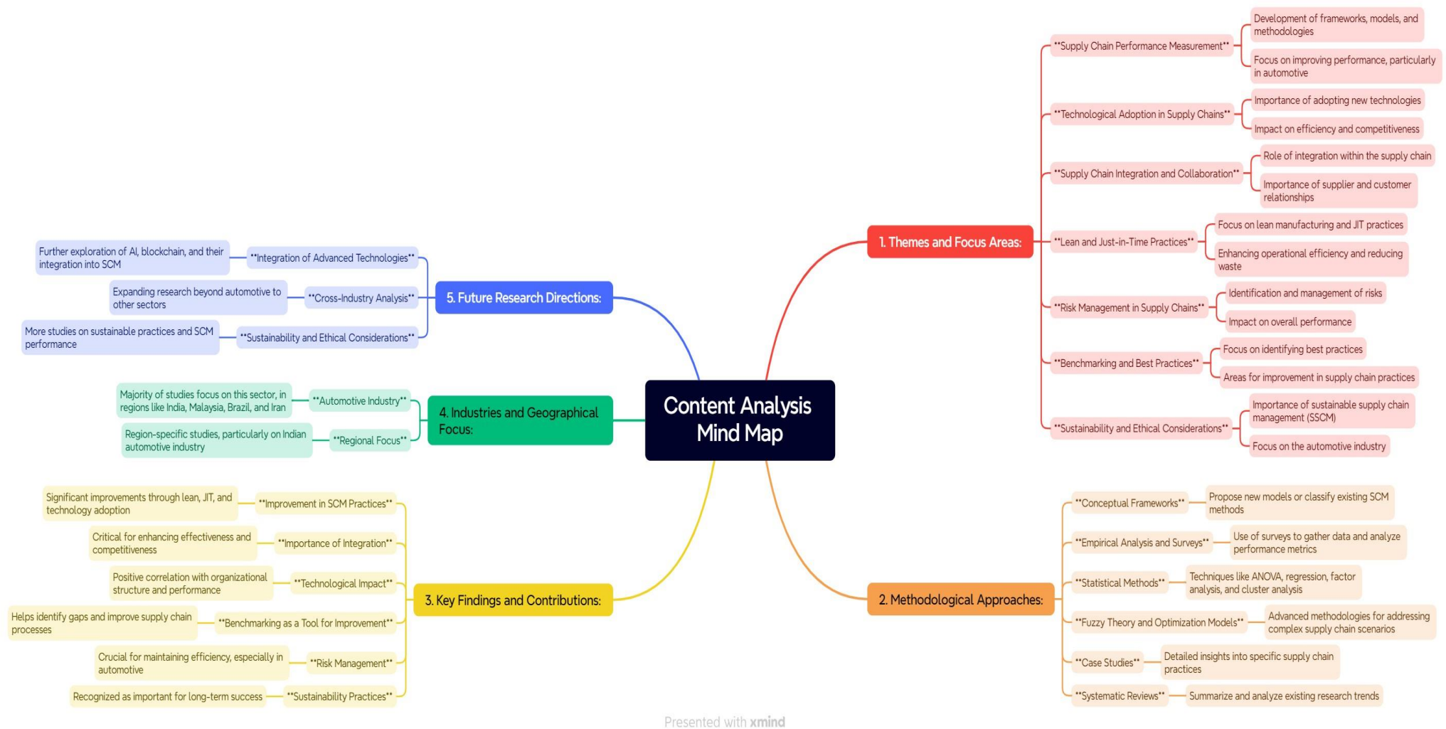
Figure 2. Mind map of content analysis